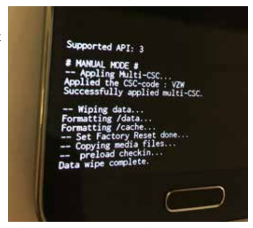
A factory reset being performed on a phone containing confidential information from an agency.