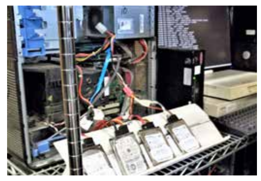
Hard drives being erased at the Airway Heights Corrections Center as part of the Computers 4 Kids program.

We made recommendations to the agencies to address specific areas where their policies and procedures did not align with state requirements and best practices.