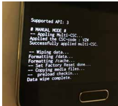
A factory reset being performed on a phone containing confidential information from an agency.