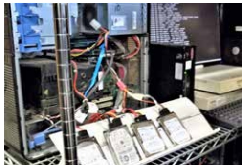
Hard drives being erased at the Airway Heights Corrections Center as part of the Computers 4 Kids program.

We made recommendations to the agencies to address specific areas where their policies and procedures did not align with state requirements and best practices.