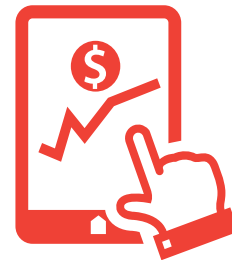
Financial Management Services